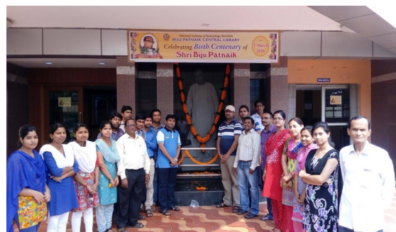
Celebration of Birth Centenary of Shri. Biju Patnaik by BPCL staff on March 5, 2016