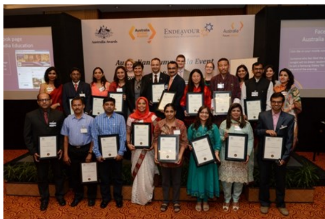
18 eminent Endeavour Awards alumni at Official launch event of Endeavour Awards Ambassador at Hotel Lalit, New Delhi