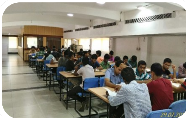
Reading areas inside the Library