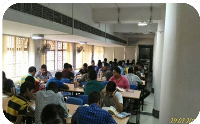
Reading halls at BPCL